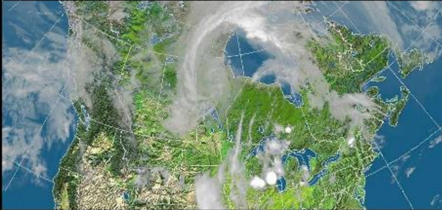
Presentation at the World Urban Forum/World Town Planning Congress Vancouver, July 2006